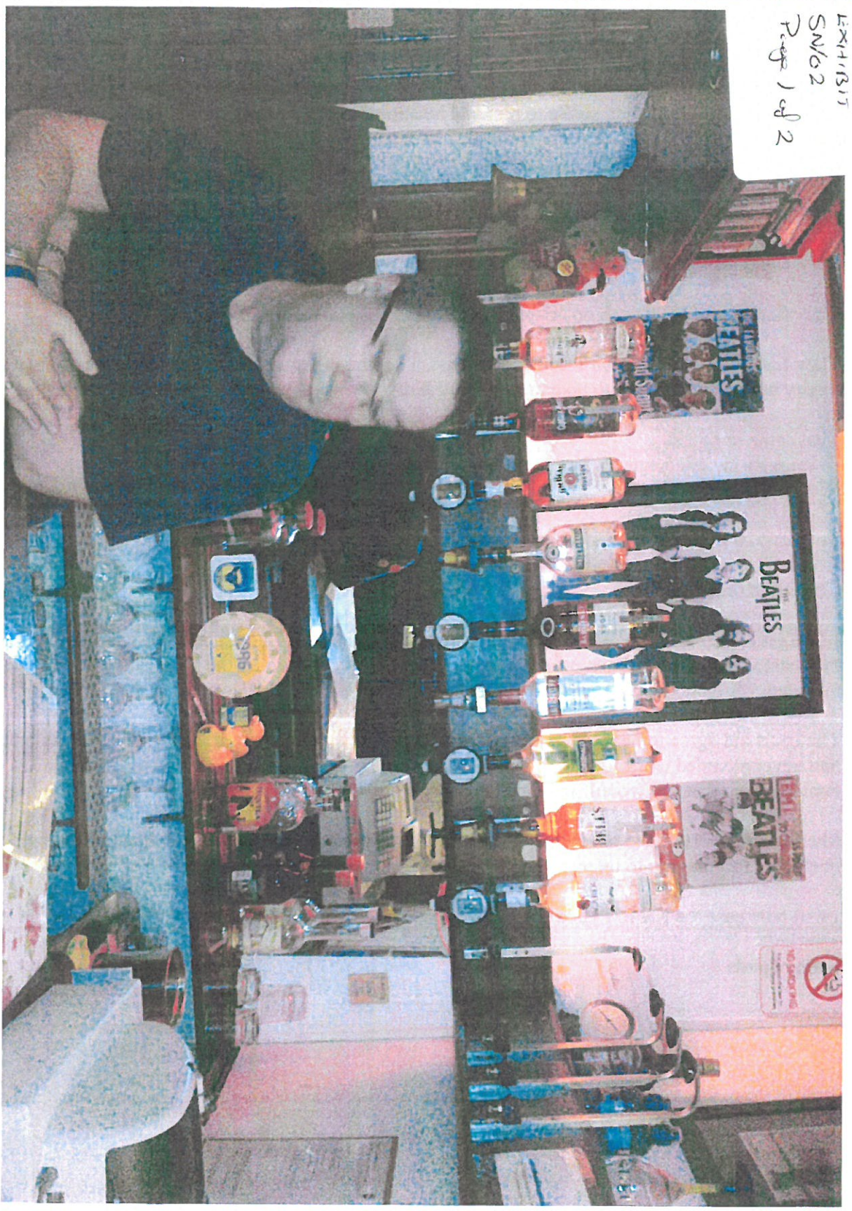
EXHIBIT SN/02 Page 1 of 2